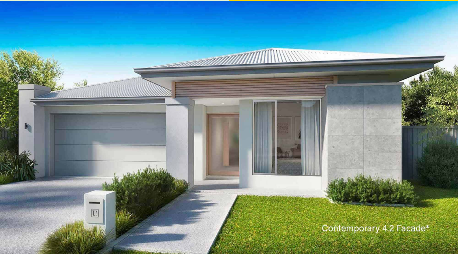
Contemporary 4.2 Facade*